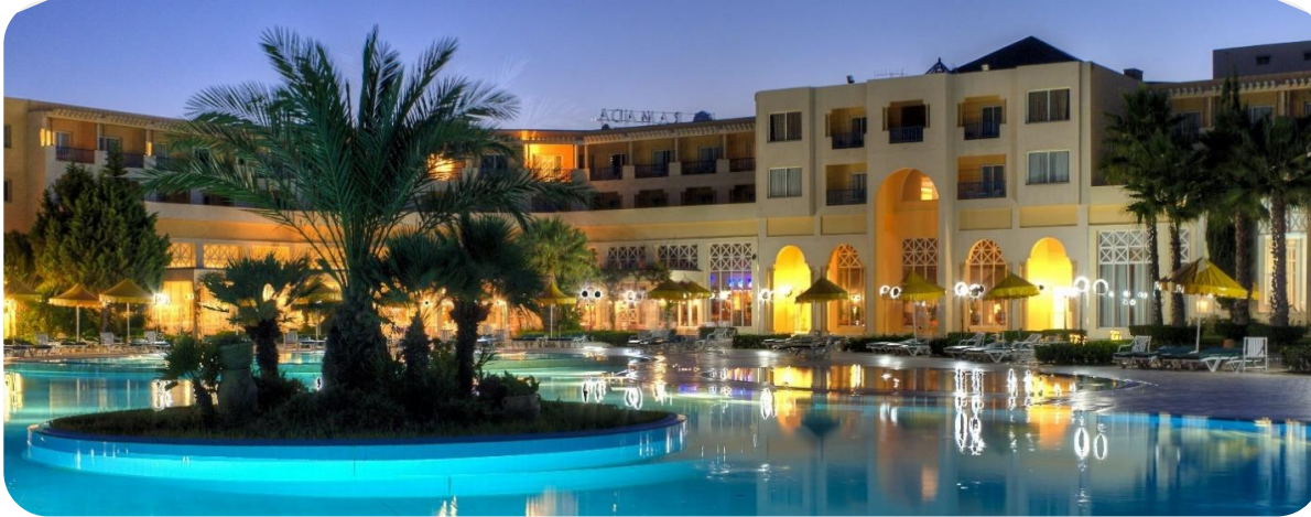
Ramada Plaza Tunis