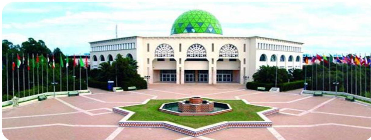
International Tunisian Fair Inc.